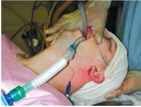
Figure 1. Bailey maneuver: insertion of an LMA Classic “behind” a tracheal tube, using the recommended technique.