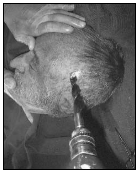
Fig. 5: Use penetrator for outer table

6. Drill the outer table of the skull with the penetrator (in the illustrated case, the carpenter's tools) (Fig. 5)