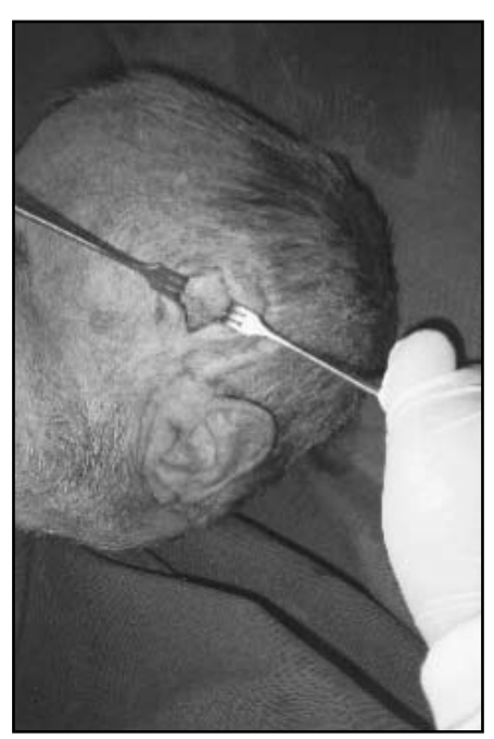
Fig. 4: Retract to minimise bleeding