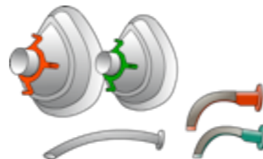
MASK, NPO, GUEDEL

FACE MASK NASOPHARYNGEAL AIRWAY GUEDEL AIRWAY CLASSIC LMA (cLMA) INTUBATING LMA (iLMA) eg : Fast Trach or AirQ