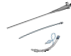
FIBEROPTIC STYLET OR FLEXIBLE FIBEROPTIC SCOPE

FIBEROPTIC INTUBATION THROUGH iLMA MALLEABLE FIBEROPTIC STYLET (eg : Levitan ) FIBEROPTIC SCOPE (eg : Ambu Ascope 2 )