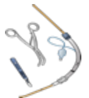
SCALPEL BOUGIE - ETT