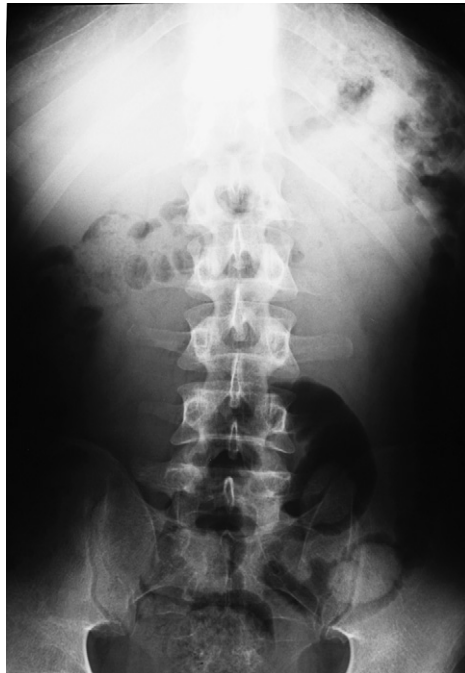
Fig. 4. Body packing with sigmoid colon condoms seen on plain films.

Flexible endoscopy is reserved for objects that are located more proximally in the rectum or the distal sigmoid colon. Endoscopy also provides excellent visualization of the mucosa to evaluate for subtle and gross changes in the rectal mucosa. Lake and colleagues 4 reported on the location of the foreign body and need for surgery.