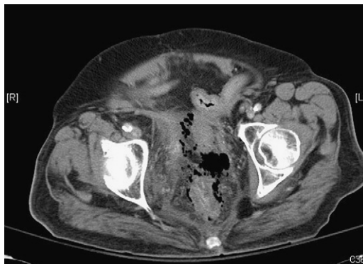
Fig. 3. Rectal perforation with extraperitoneal air seen on CT scan.

When attempting to remove a rectal foreign body transanally, the most important factor in successful extraction is patient relaxation. This can be achieved with a perianal nerve block, a spinal anesthetic, or either of these in combination with intravenous conscious sedation. All of these techniques allow the patient to relax, decrease anal