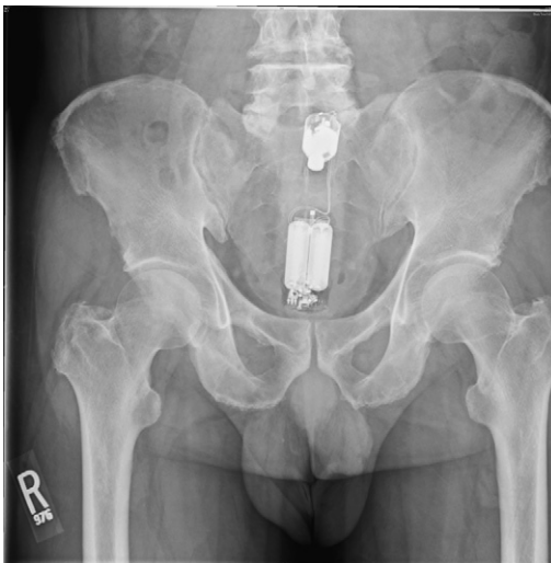
Fig. 2. Rectal vibrator on abdominal plain film.

The first step in the evaluation and management of a patient with a rectal foreign body is to determine whether or not a perforation occurred. When a perforation is suspected, it should be determined as soon as possible whether the patient is stable or unstable. The history and physical examination helps to determine if the patient has peritonitis, whereas the plain radiographs may help localize the object and rule out free air. These steps in conjunction with each other allow one to decide if the situation is a surgical