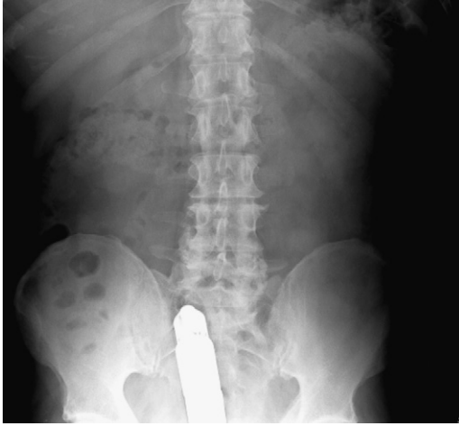
Fig. 1. Rectal dildo on abdominal plain film.

needed. Hence, a clot in the blood bank and general chemistries that may be useful to the anesthesia provider should be ordered. Radiologic evaluation is far more important than any laboratory test. A flat and upright series of the abdomen will show the location of the object and the presence or absence of pneumoperitoneum ( Figs. 1 and 2 ).